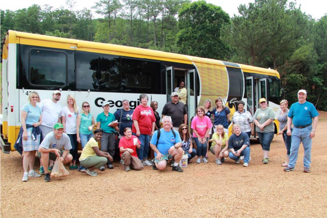
Figure 1. Field trip to Barite mine (top), Vulcan materials quarry (bottom)

Additionally all other class materials including PowerPoint presentations, lab exercise documents, mini quizzes, videos and photographs are distributed to the teachers.